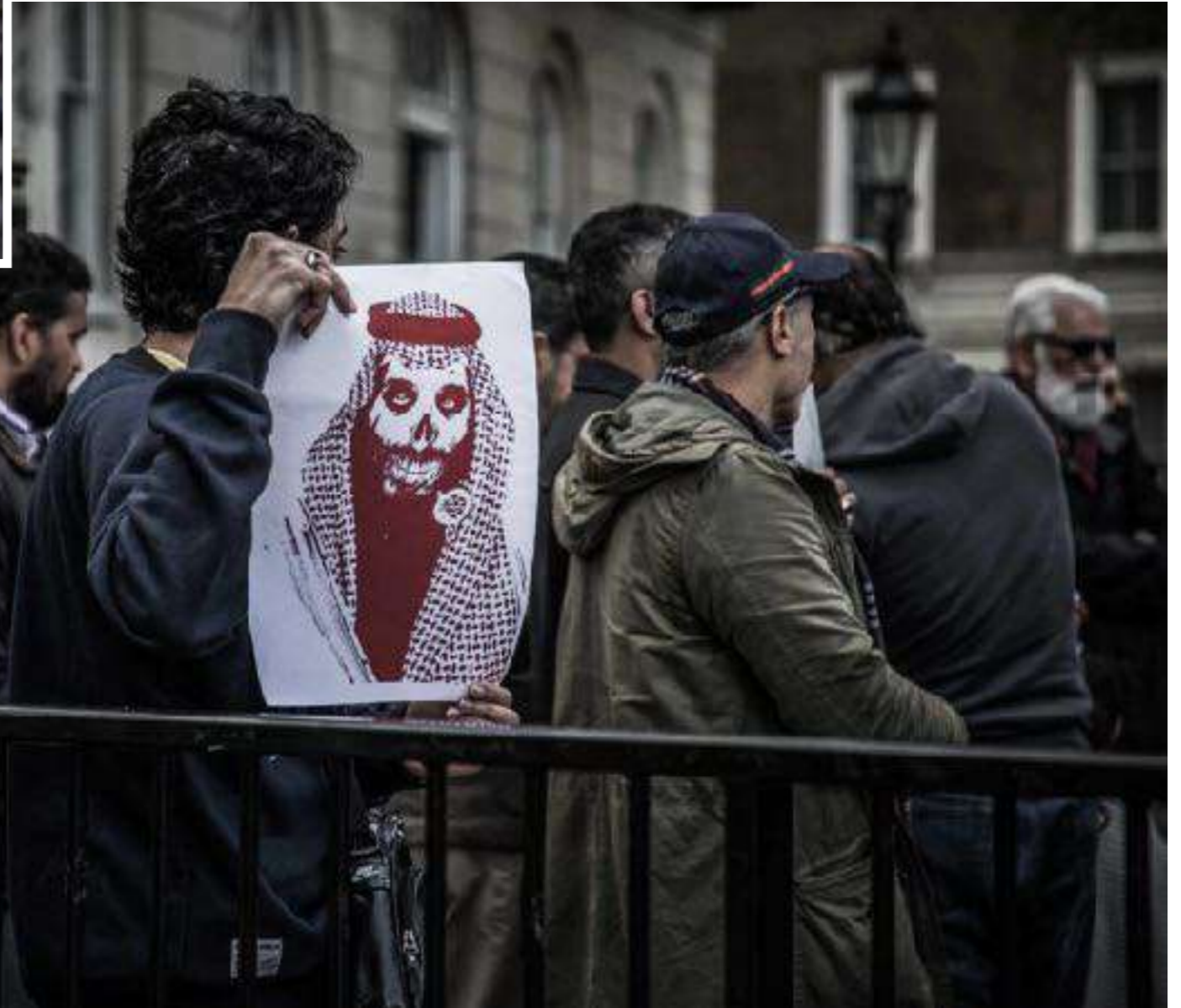
PRO YEMEN PROTEST