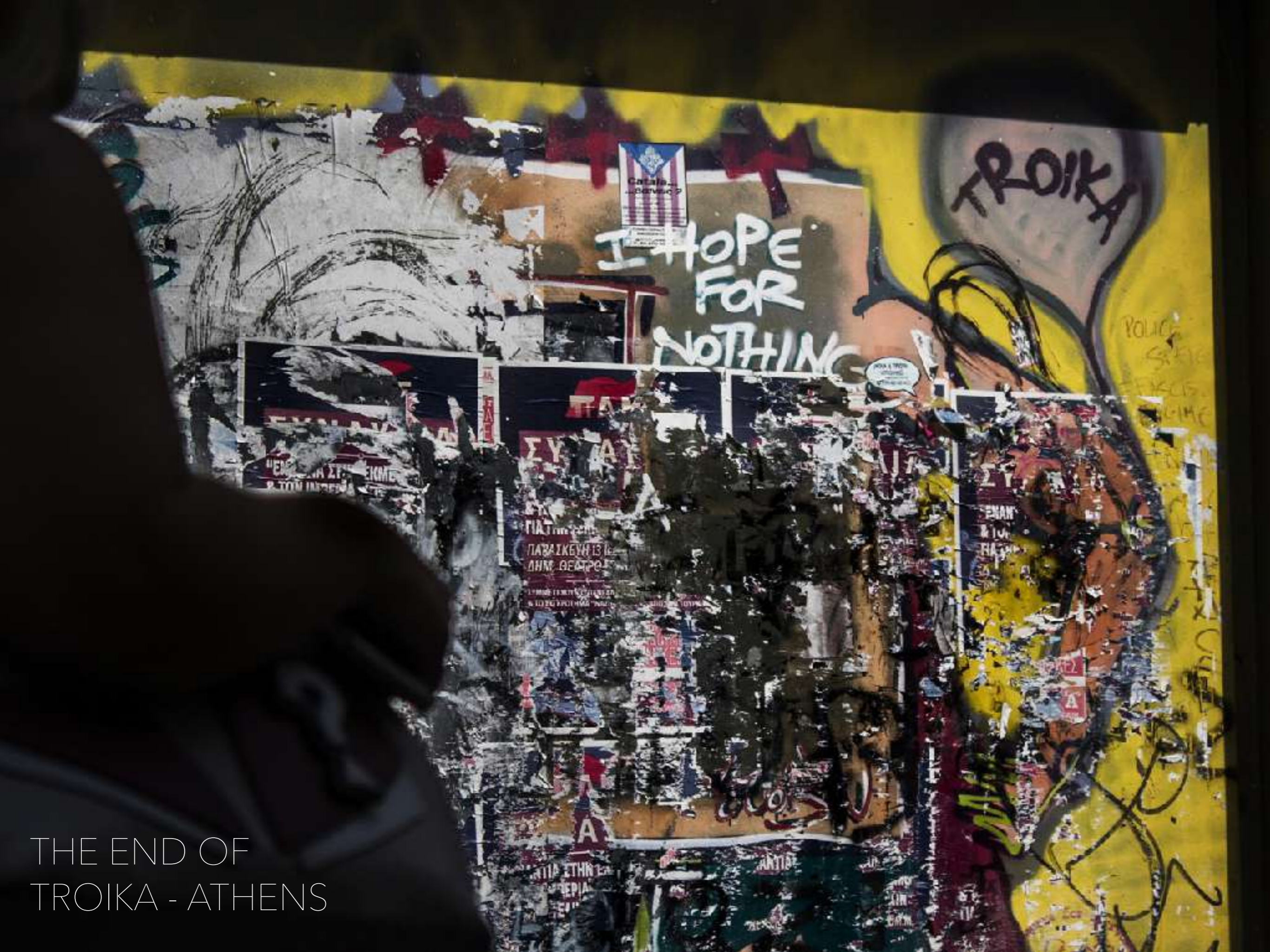
THE END OF TROIKA - ATHENS